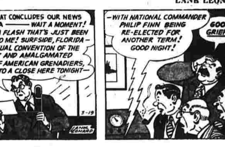
Repeat Performance! LANK LEONARD

Man climbing a tree to catch a fish... Revenue officers climbing to the top of Gray Knob... To locate a still.