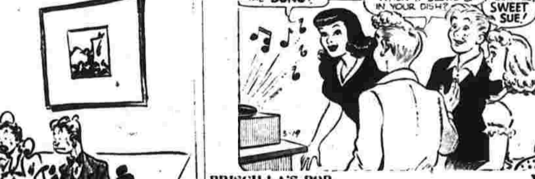
ALLEY OOP On Their Way! BY V. T. HAMLIN